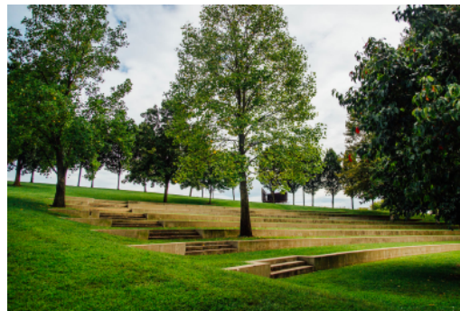
Brown Forman Amphitheater & Lawn Daily User Fee - $2,000