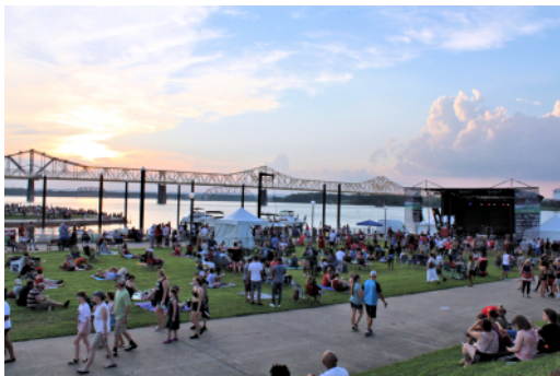
Harbor Lawn Daily User Fee - $2,000