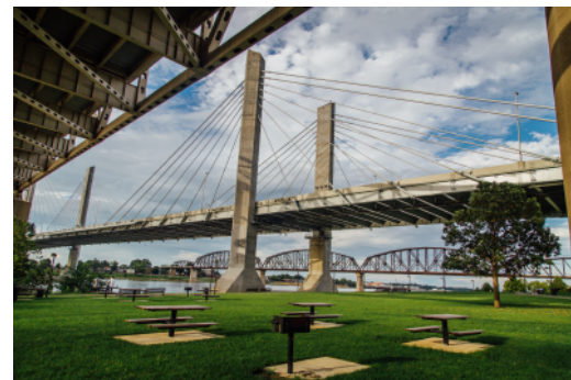
Under The Bridges Daily User Fee - $2,000