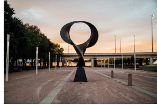
Festival Plaza Daily User Fee - $2,500