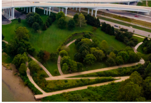
Orange or Purple Upland Meadow Daily User Fee - $2,000