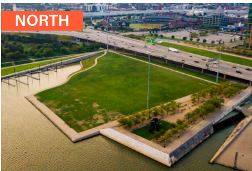
North Great Lawn Daily User Fee - $2,500