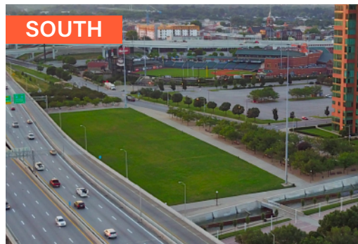
South Great Lawn Daily User Fee - $2,500