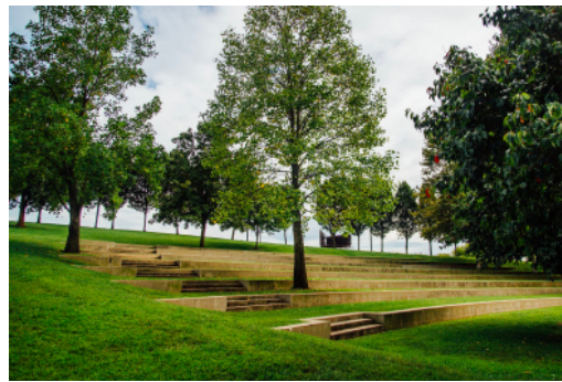
Brown Forman Amphitheater & Lawn Daily User Fee - $2,000